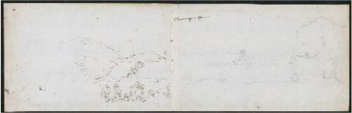
Fig. 4. Francis Place, Tenby , NMWA 3355 (verso)