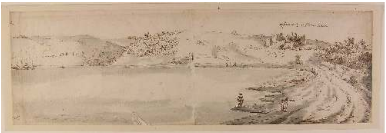
Fig. 3. Francis Place, Oystermouth Castle , NMWA 16368