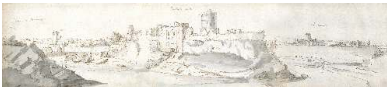
Fig. 8. Digitally stitched image created from recto and verso of NMWA 16371

inside cover. This sheet joins up with the last sketch in the first sketchbook. Unfortunately, one third of this last page is pasted down but on the small part that can be lifted a definite pencil line can be seen—potentially this pencil line, or horizon, matches up with that on one of our sketches.