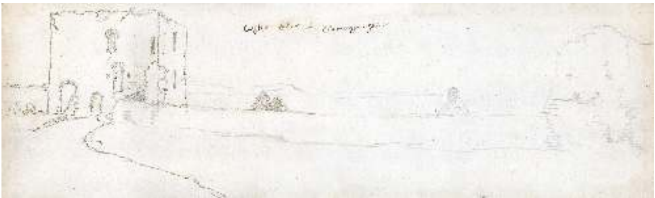
Fig. 5. Digitally stitched image created from the versos of NMWA 16367 and 3355

by turning over the sheet the sketches on the verso can be revealed on the left (fig. 1) and right (fig. 2).