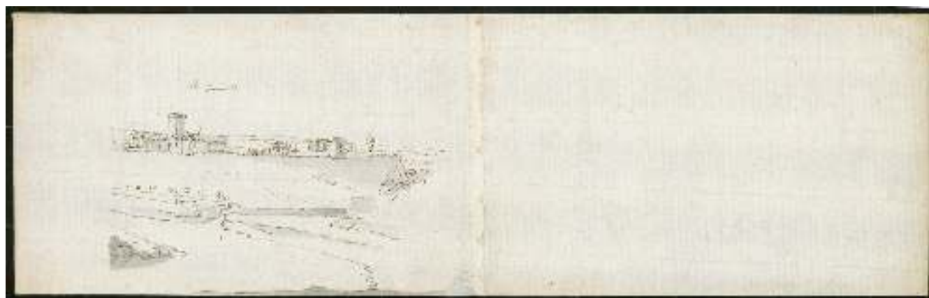
Fig. 6–7. Francis Place, Pembroke , NMWA 16371, recto (top) and verso (bottom)