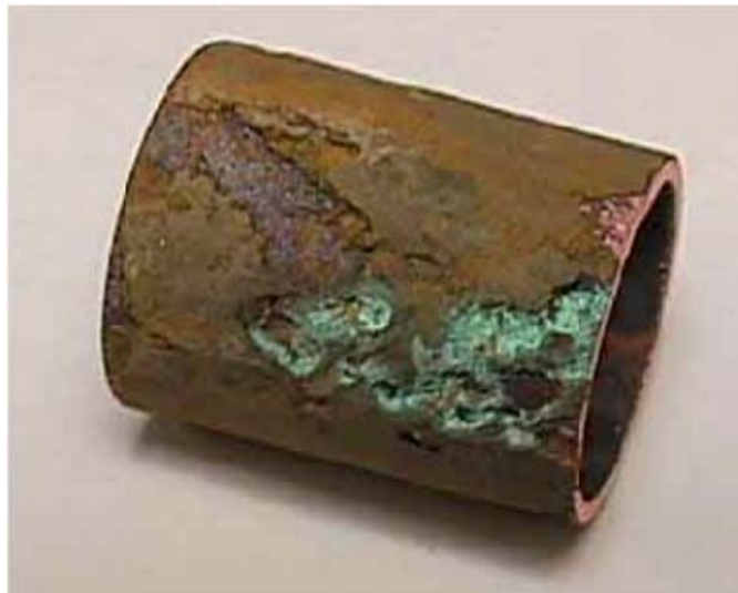
Figure 1.1: Piece of gas pipeline with external corrosion (Thompson, 2001)

Figure 1.1 and Figure 1.2 show the examples of corrosion effect in which gas pipelines have been damaged by external corrosion.