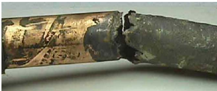
Figure 1.2: Ruptured gas pipeline due to corrosion (Thompson, 2001)