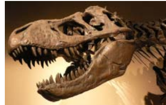
Tyrannosaurus rex skull and upper vertebral column, a victim of the fifth major extinction. Palais de la Découverte, Paris

There is little doubt left in the minds of professional biologists that Earth is currently faced with a mounting loss of species that threatens to rival the five great mass extinctions of the geological past. As long ago as 1993, Harvard biologist E.O. Wilson estimated that Earth is currently losing something on the order of 30,000 species per year — which breaks down to the even more daunting statistic of some three species per hour. Some biologists have begun to feel that this biodiversity crisis — this “Sixth Extinction” — is even more severe, and more imminent, than Wilson had supposed.